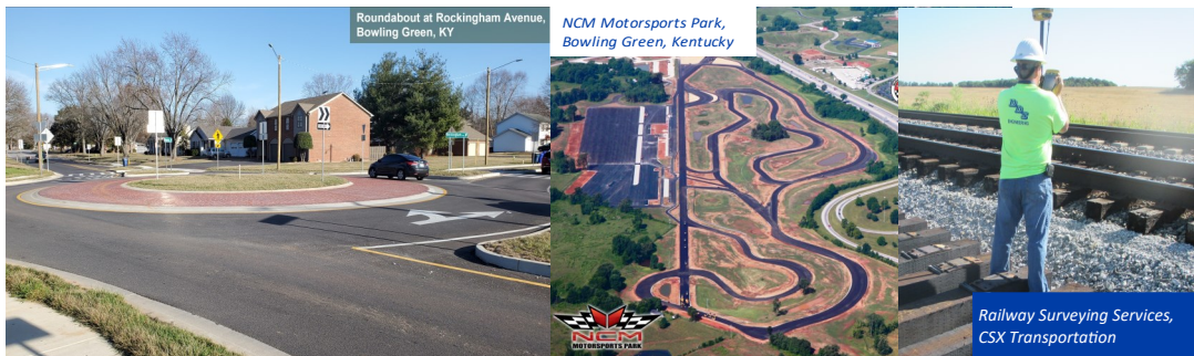
Roundabout at Rockingham Avenue, Bowling Green, KY